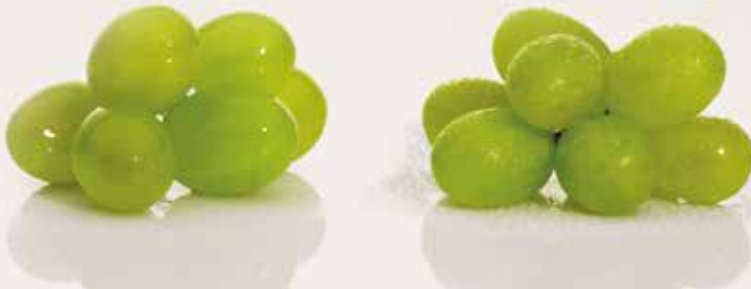
Figure 1: Water alone and with BREAK-THRU® S 240 covering a much larger area.

BREAK-THRU® S 240 is a non-ionic surfactant and belongs to the chemical class of organomodified trisiloxanes. These are the only agricultural adjuvants that can produce a phenomenon known as “super spreading” i.e. the rapid coverage of hydrophobic surfaces such as leaves at concentrations of 0.1 % or less. Aqueous solutions containing BREAK-THRU® S 240 have zero contact angle (Figure 1) – in contrast to water treated with conventional surfactants such as nonylphenol ethoxylates (Figure 2).